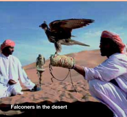
Falconers in the desert

There is only one place on earth where the world's most extensive entertainment complex, tallest structure, and largest artificial islands can be found. Welcome to Dubai, city of the future. This tour is a groundbreaking excursion providing travelers access to the most prestigious architectural and technological marvels found anywhere on the globe. Begin at the Tatweer headquarters, where you'll be privy to the plans of Dubailand, which at 3 billion square feet is twice the size of Disney World. Continue to the Burj Khalifa, currently the world's tallest man-made structure, and ascend to the observation deck for an unobstructed, breathtaking panorama of the city, desert and ocean. If you wish, venture outside onto the open-air terrace for another perspective of the