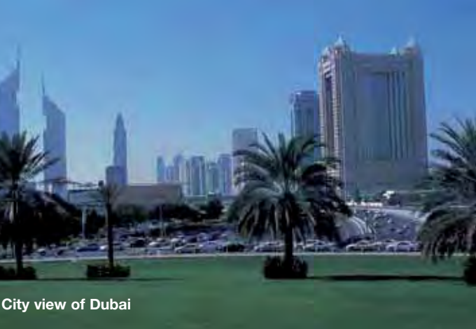
City view of Dubai