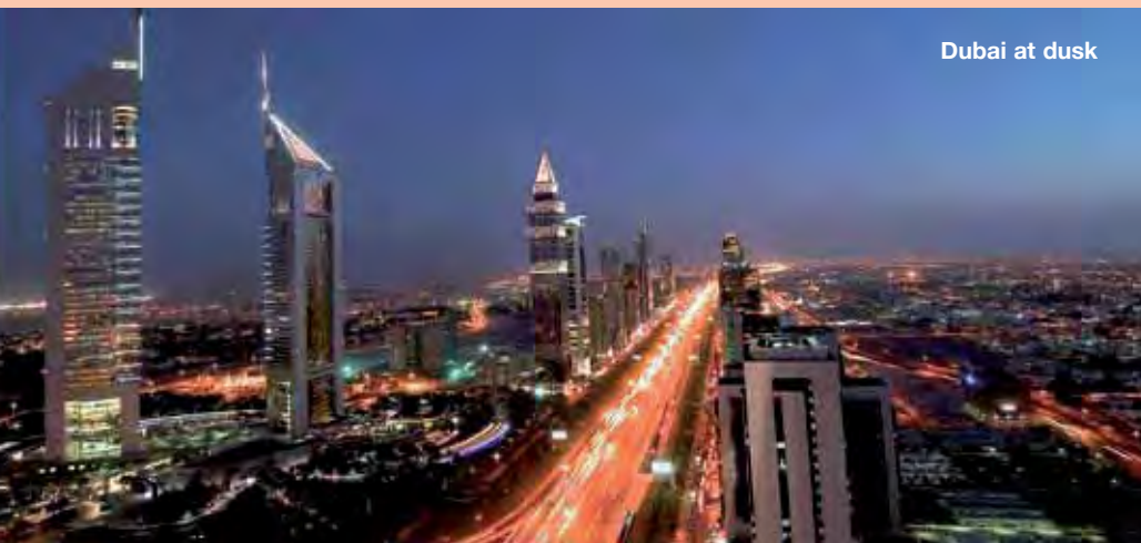
Dubai at dusk

Optional excursions featured will be available to purchase 45 days prior to departure for an additional charge. Call for approximate prices. Scheduling is subject to change.