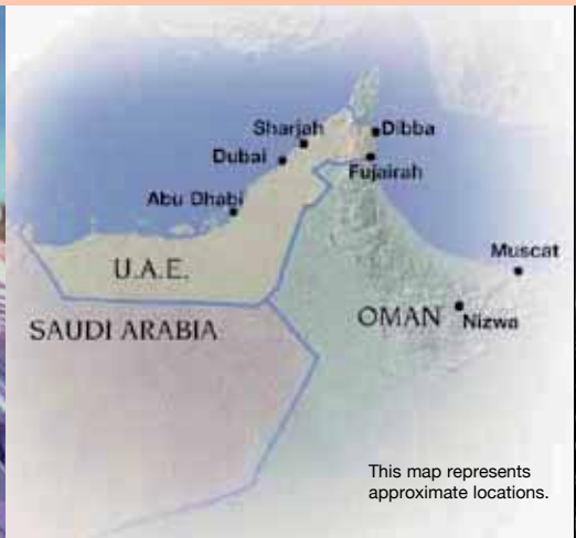
This map represents approximate locations.