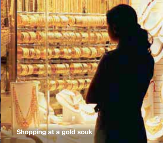
Shopping at a gold souk

sweeping views below. Next visit the offices of Nahkheel, where the plans for the revolutionary Palms were born. Considered to be the 8th wonder of the world, these man-made islands can be seen from space and encompass first-class hotels, luxury villas, beaches, marinas, and more. Let these marvels materialize before your eyes on a panoramic drive of the Palm Jumeirah islands. The day concludes with lunch (included).